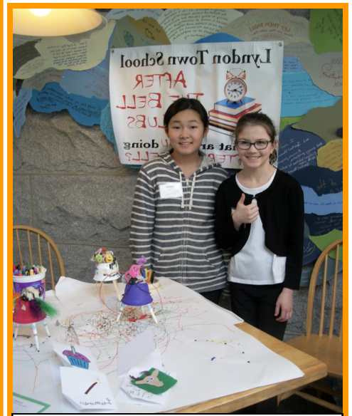
LTS students showing STEM at the State House