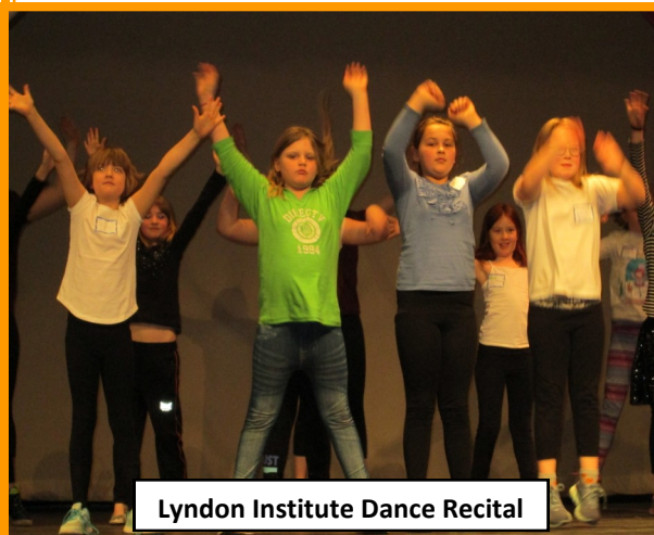
Lyndon Institute Dance Recital