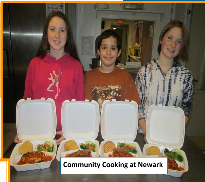
Community Cooking at Newark

Scholarships are Available — See School Principals